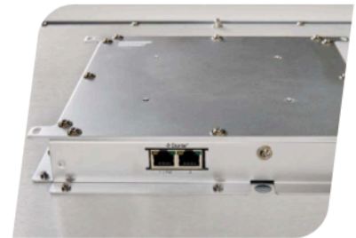
Dual RJ45 Network Ports