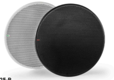
MXA925-R Ceiling Array Microphones Front