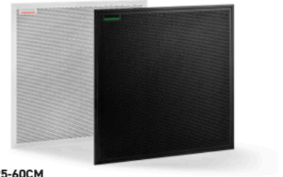
MXA925-60CM Ceiling Array Microphones Front