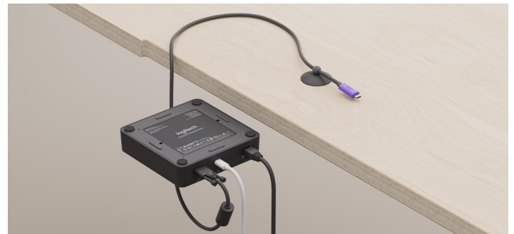
Optional USB-C power delivery

Deliver up to 100W of power to a laptop or mobile device by connecting a standard USB-C power adapter to the Table Side (TX) box.