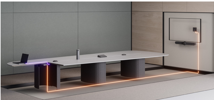
Extended reach with a standard category cable

Deploy with standard category cabling to extend BYOD connections up to 100 meters 1 to fit the size and layout of your larger meeting rooms.