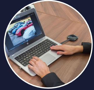
Connect to CleverCast with one tap