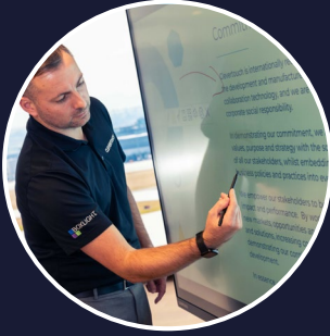
Collaboration Tools at your fingertips