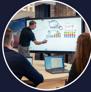
Enhanced Boardroom Collaboration