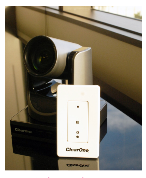
Add Your Choice of Peripherals Add ClearOne's Wall-Mount Bluetooth Expander and UNITE® cameras to complete your collaboration system.