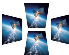
H/V Keystone: ±30 °

Support vertical / horizontal keystone correction and 4-corner geometric adjustment, allowing for virtually unlimited mounting flexibility.