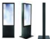
Totems TOT-XXX95H-IR10 TOT-XXX95H-CA10