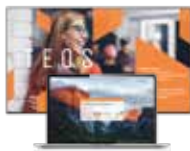
Connect for TEOS license TEC-SC100