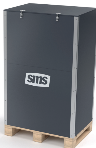
The product is delivered in an attractive and practical wooden crate.