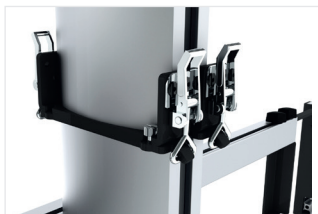
Eccentric lock for quick and easy assembly.