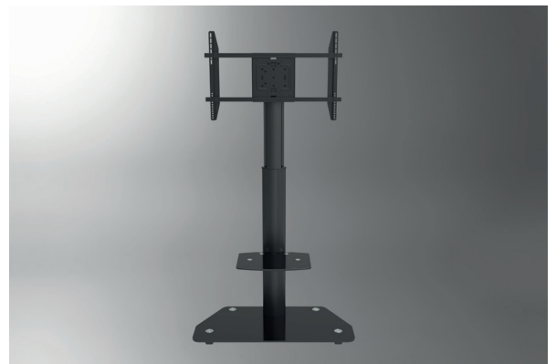
celexon Professional Adjust-3270MP Portrait