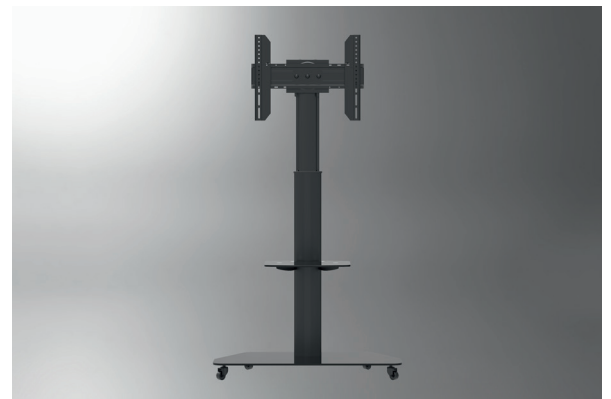
celexon Professional Adjust-3770MP