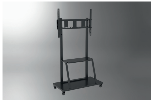
celexon Economy Adjust-55110MP