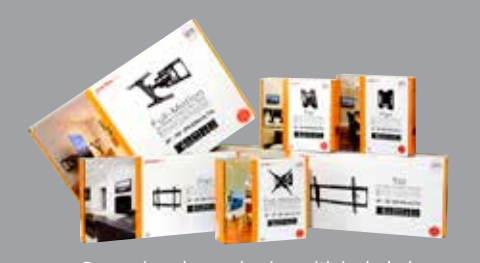
Comes in color packaging with included installation hardware and easy to follow instructions.