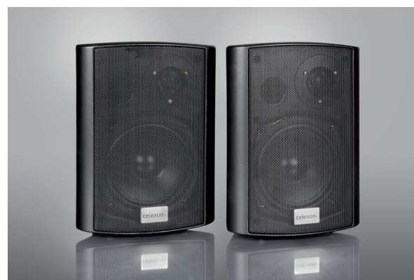
active loudspeaker 525-B

Thanks to an active and a passive device, the loudspeaker set can be connected directly to an audio source without further amplifiers. For this purpose, either a screw terminal or a 2-pin RCA input are available. Audio signals are reproduced powerfully, dynamically and without distortion with an RMS power of 2x30W and a frequency range of 20Hz - 20,000Hz.