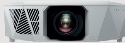
EH-QL3000W / EH-QL3000B