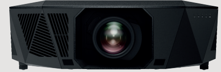
EH-QL7000W / EH-QL7000B